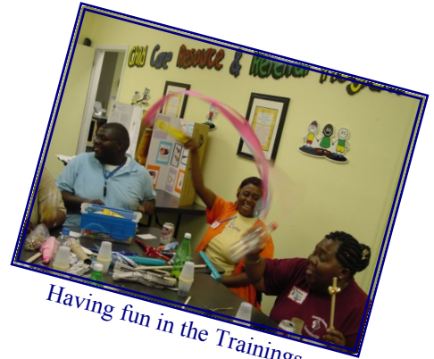
Having fun in the Trainings