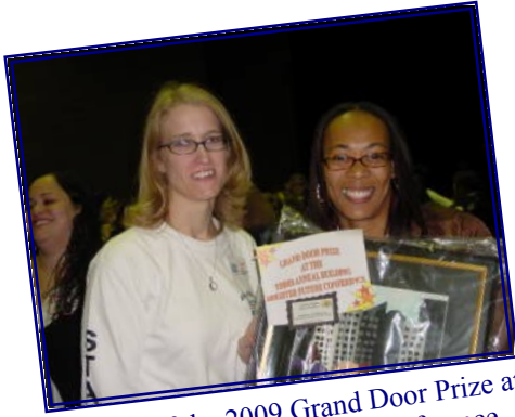
Winner of the 2009 Grand Door Prize at Building Brighter Futures Conference.