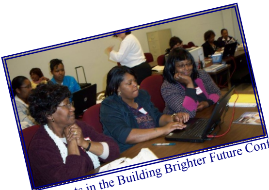
Participants in the Building Brighter Future Conference